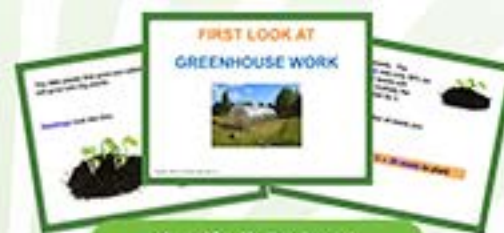
Specifically Designed Special Education Versions