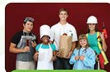
Real Tools for Real Job Skills