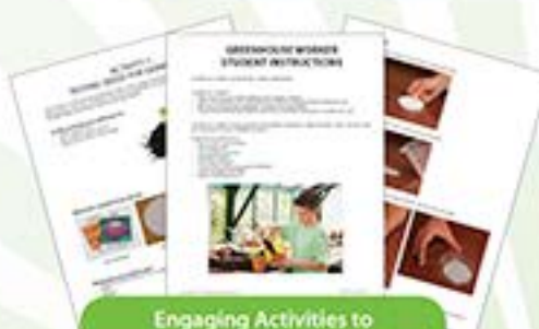
Engaging Activities to Motivate Your Students