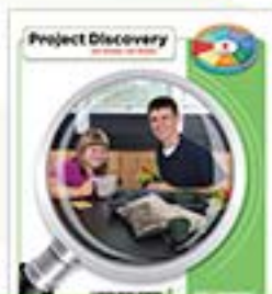
Classroom Ready Instructions