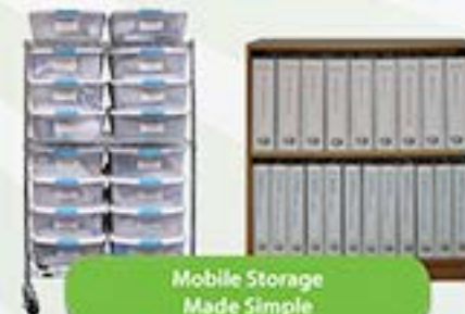
Mobile Storage Made Simple

Project Discovery is all about student success! Project Discovery is a coordinated set of activities that help transition students to be college or career ready, life ready and live independently. Project Discovery is validated by the US Dept. of Education and incorporates assessments, differentiated instruction, technology and real life hands-on experiences. Ease of implementation by the instructor, effective outcomes for the student and providing data for the administrator .