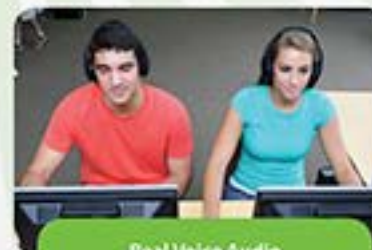
Real Voice Audio